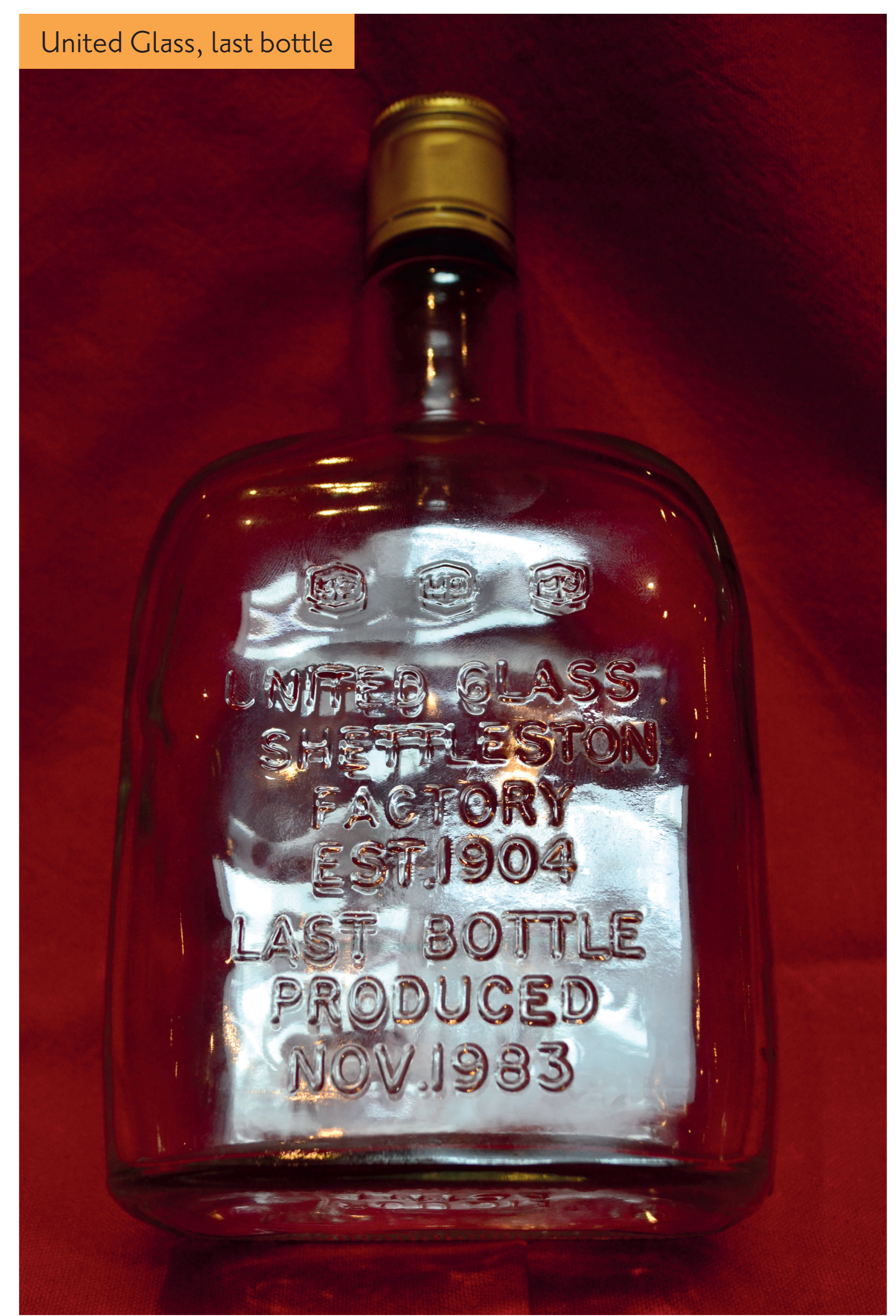
United Glass, last bottle

I started as part of a team who manually unloaded the trains coming into the siding at the Shettleston Juniors football pitch. They brought sand and crushed glass and returned wooden crates. We palletted the boxes and drove them into the Lehrs (a conveyor belt) for the sorter to fill. There were two big furnaces which fed auto machines that blew the molten glass into moulds. Each bottle sorter checked for defects then the packers placed them into the wooden boxes. They were shipped to America, South America, Canada, China and Australia."